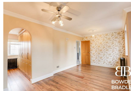
Study 7'8 x 5'6 (2.34m x 1.68m )